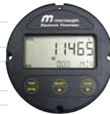
Standard LC Display