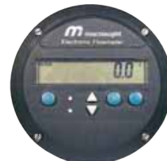
Deluxe LC Display