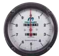
Analogue Mechanical Register