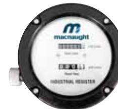
MH450 Industrial Register