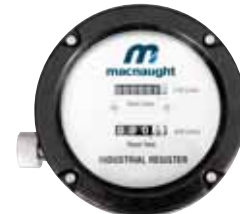
MH450 Industrial Register