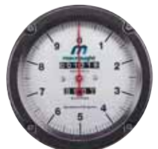
Analogue Mechanical Register