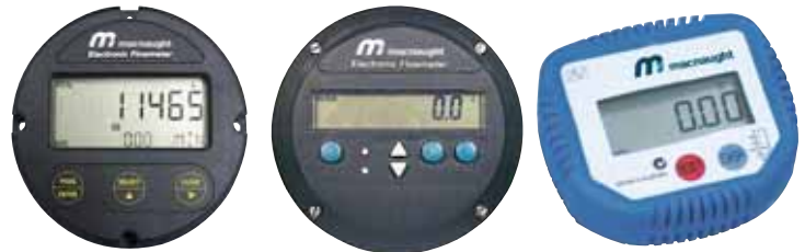
Standard LC Display