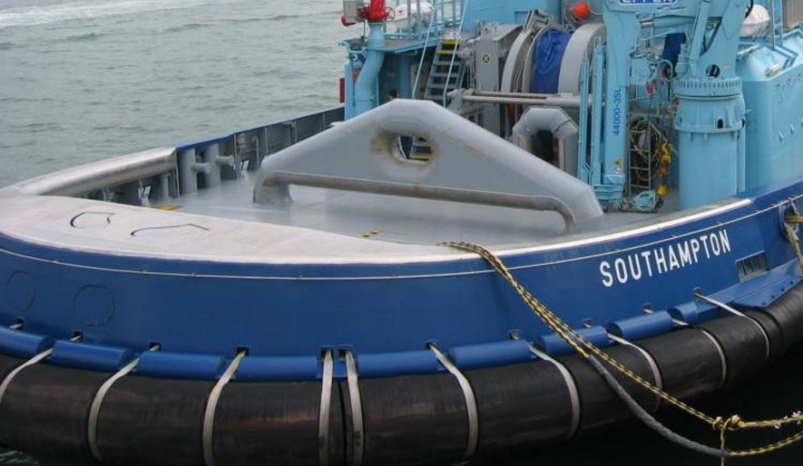
Stainless steel towingpins for escort tugs .