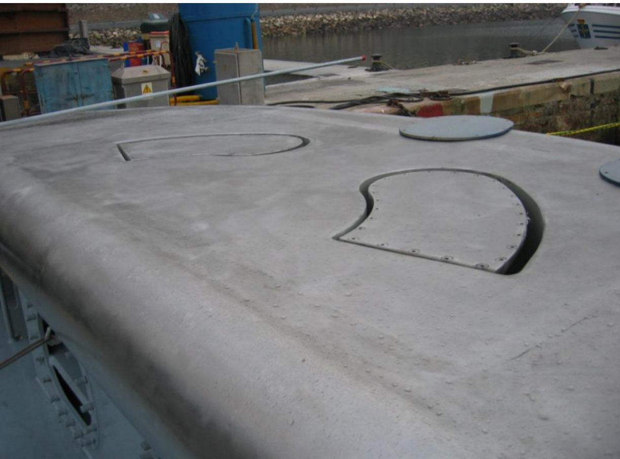
Stainless steel towingpins for escort tugs.