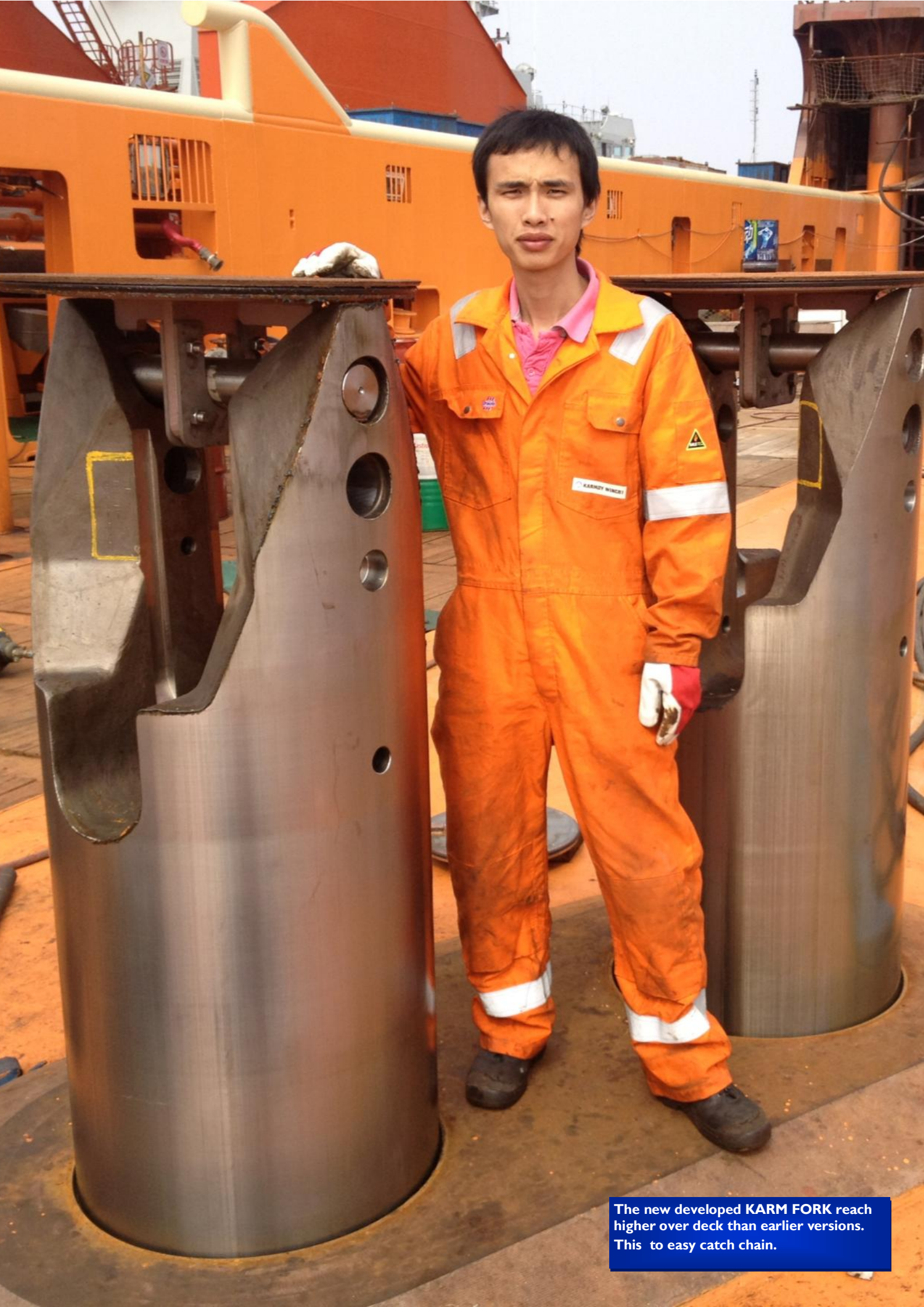
The new developed KARM FORK reach higher over deck than earlier versions. This to easy catch chain.