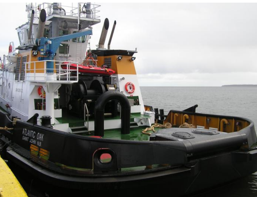
Karm Fork with towing pins.

We design Karm Fork, towings pins, towing points and pop up pins.