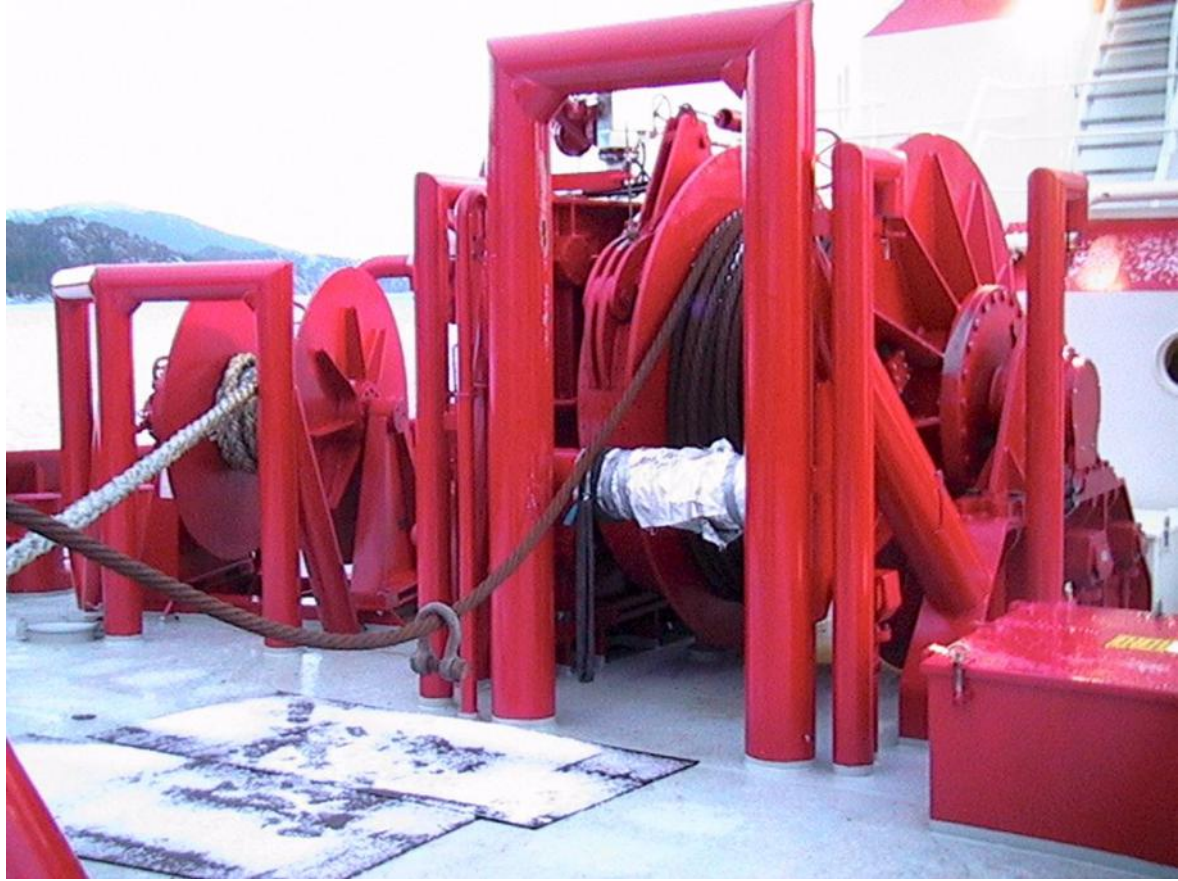
The winches is delivered with pull capacity up to 300 tons.