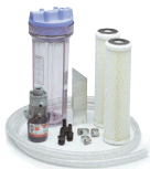
Silt Reduction Kit

For waters with high levels of suspended matter, e.g. in shallow anchorage, we would recommend you use an additional prefilter. This additional filter is finer (5 microns - 1 micron = 0.001 mm) than the standard filter (30 microns) and is placed after it. A booster water pump (12V/0.8 A/h) is also provided. This pump compensates for the loss through the second filter and increases water production. We would also recommend the prefilter kit when the Power Survivor is not installed under the water line and when it is in constant use to increase the intervals between servicing.