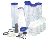
Extended Cruise Kit