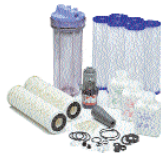
Preventative Maintenance Kit