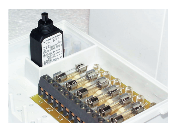
Miniature circuit-breaker and glass tube fuses fitted in transformer. The miniature circuit-breaker can be reset manually, whereas the glass tube fuses have to be replaced when they blow.

Thermal fuses blow at a given temperature. When the ambient temperature exceeds the melting point of the temperature-sensitive fuse element, it melts and breaks the circuit. This makes it suitable for circuit breaking at high temperatures in most electronic and electrical equipment. A thermal fuse can therefore not be reset. It has to be replaced if possible.