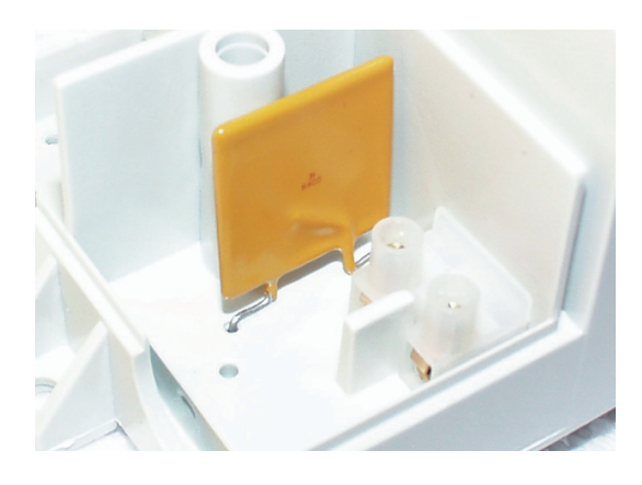
PTC mounted in an LF transformer

A PTC has many advantages over ordinary fuses. It can be reset easily by disconnecting the line voltage for a few seconds or the short circuit/load if it is in a secondary circuit.