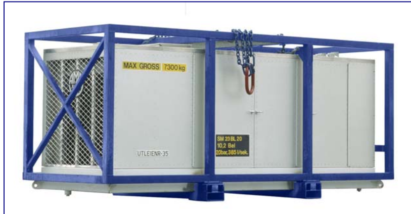
Zone 2 27m 3 /min